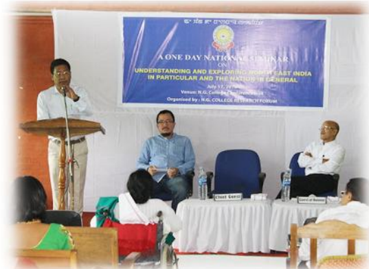
ONE DAY NATIONAL SEMINAR ON UNDERSTANDING AND EXPLORING NORTH EAST INDIA (2016)