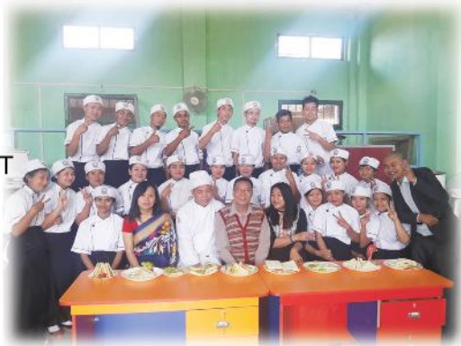
HOSPITALITY MANAGEMENT TEAM OF DDU KAUSHAL CENTRE, N.G. COLLEGE