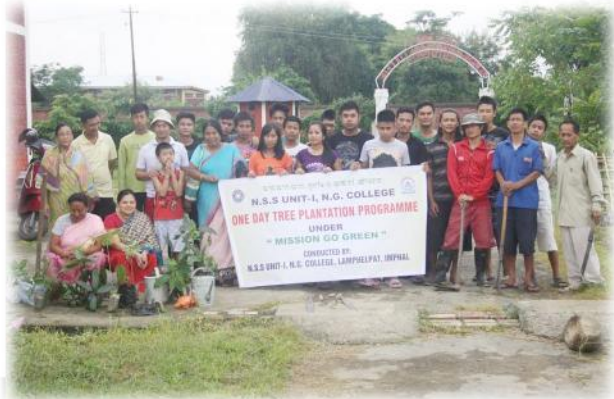
TREE PLANTATION PROGRAMME UNDER MISSION GO GREEN