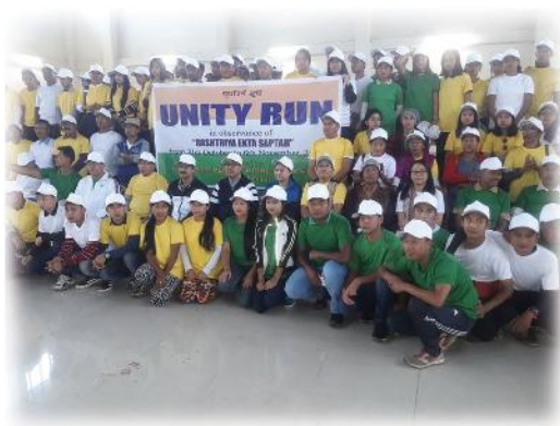
STUDENTS PARTICIPATING IN THE UNITY RUN 2017