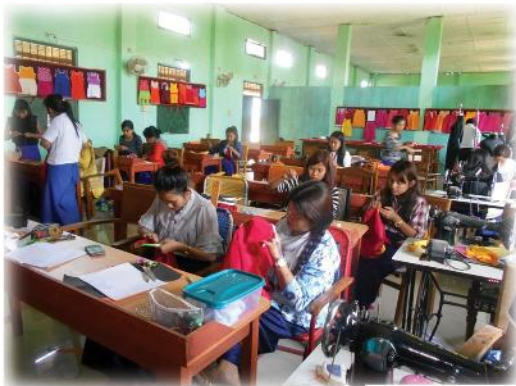
STUDENTS OF FASHION DESIGNING IN THE PRACTICAL ROOM