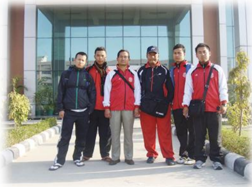
N.G. COLLEGE REPRESENTING MANIPUR UNIVERSITY AT ALL INDIA INTER UNIVERSITY BADMINTON TOURNAMENT AT ROHTAK UNIVERSITY IN THE YEAR 2013