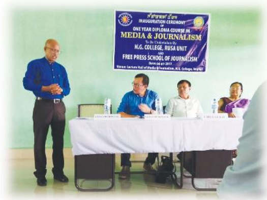
INAUGURATION CEREMONY OF ONE YEAR DIPLOMA IN MEDIA & JOURNALISM UNDER RUSA SCHEME