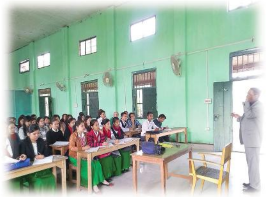
TEACHER DELIBERATING LECTURE IN A CLASSROOM