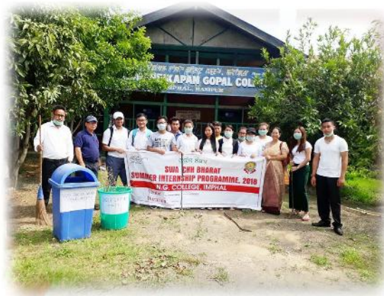
STUDENTS & TEACHERS PARTICIPATING IN THE SWACHH BHARAT SUMMER INTERNSHIP PROGRAMME 2018