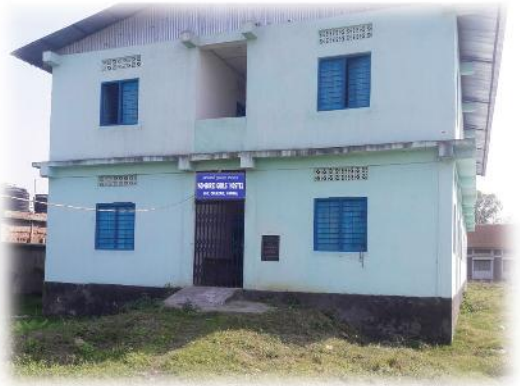
KOMBIREI GIRLS' HOSTEL