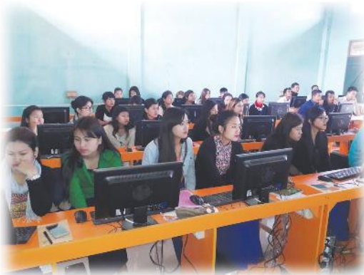
STUDENTS ATTENDING PRACTICAL CLASS IN THE ICT ROOM, N.G. COLLEGE