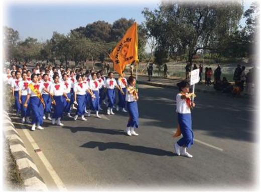
STUDENTS OF N.G COLLEGE PARTICIPATING IN THE REPUBLIC DAY