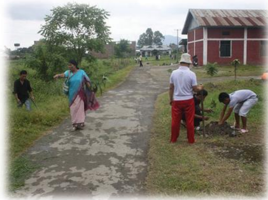
N.G. COLLEGE NSS UNIT