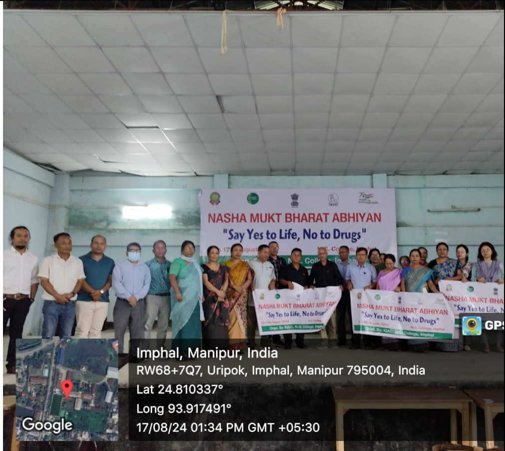
Photo with Geo Stamp

Event Photo (Paste here a Maximum 2 Photo)