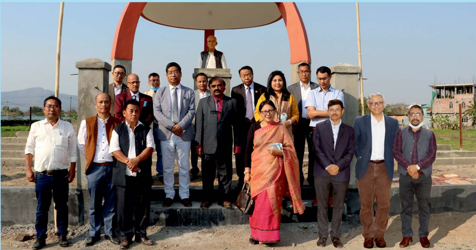
NAAC Peer Team with Vice Chancellor of Manipur University and Director of University & Higher Education Government of Manipur.