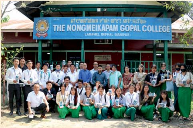
Distribution of Smart Phones to Students under CMCMESS