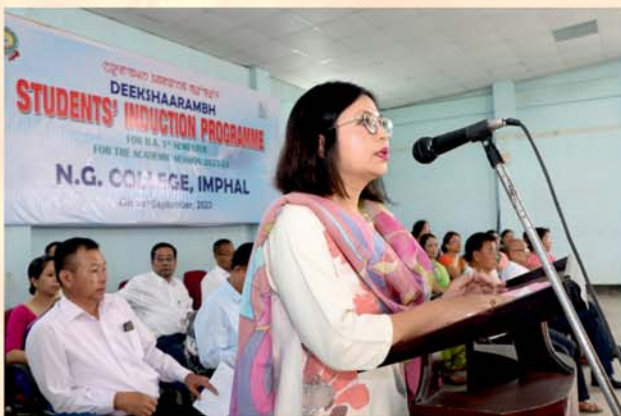
Students' Induction Programme 2023-24