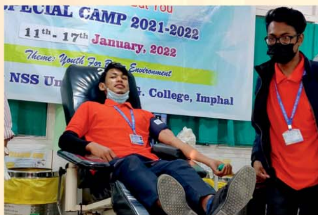
Blood Donation by NSS volunteers