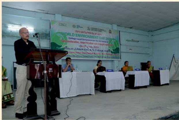
World Environment Day 2024