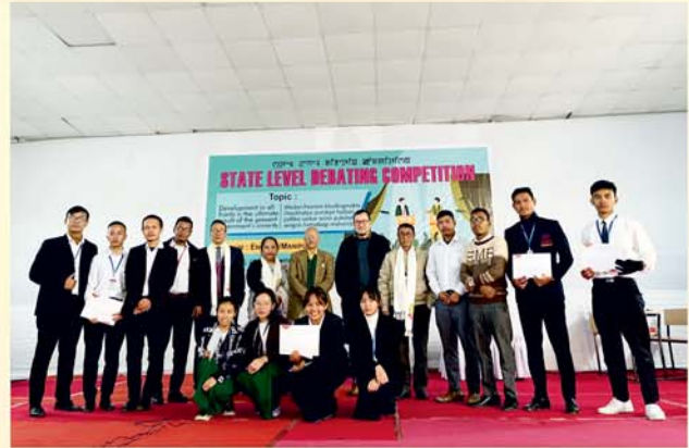
State Level Debating Competition