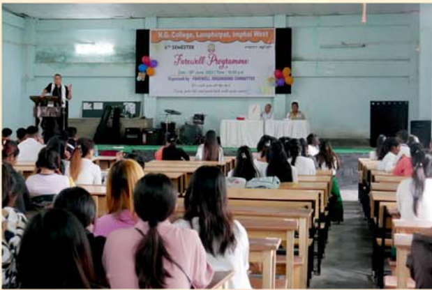
6th Semester Farewell Programme