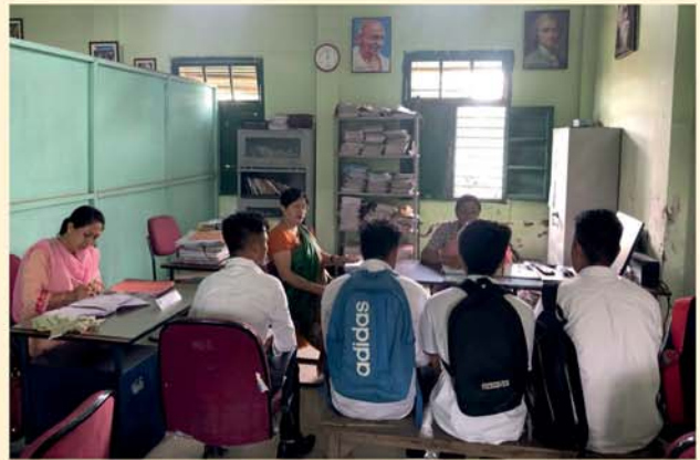
Project Viva of Edn. Dept. by External Examiner.