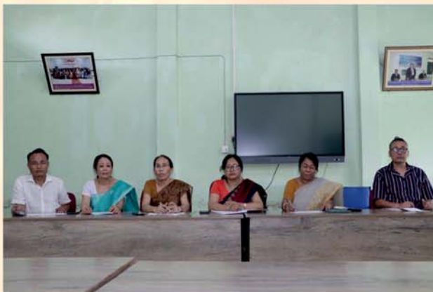
Admission 2024-25 Screening in Progress