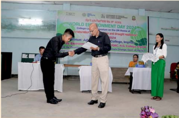
Symposium Prize Distribution on World Environment Day 2024