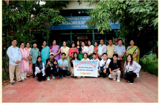
History Dept. Study Tour 2024