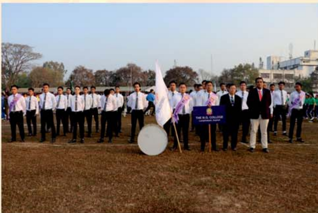
Republic Day 2023