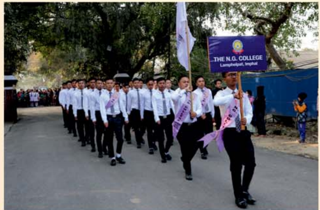
Republic Day 2023