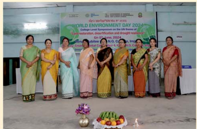
World Environment Day 2024