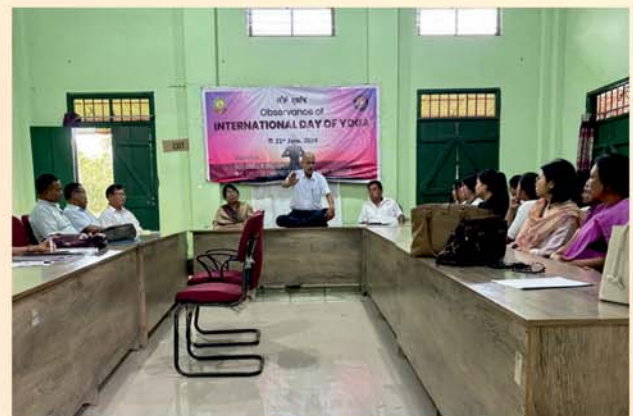
Observance of International Day of Yoga 2024