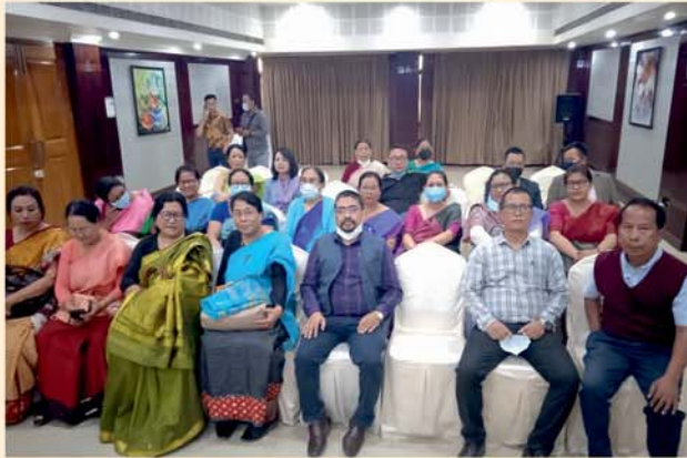
NAAC Exit Meeting at Hotel Classic