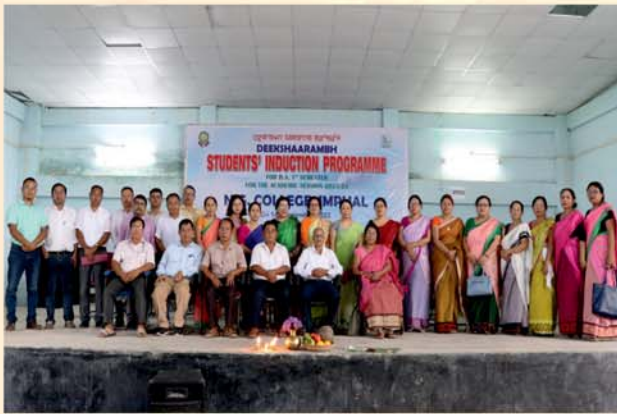
Students' Induction Programme 2023-24