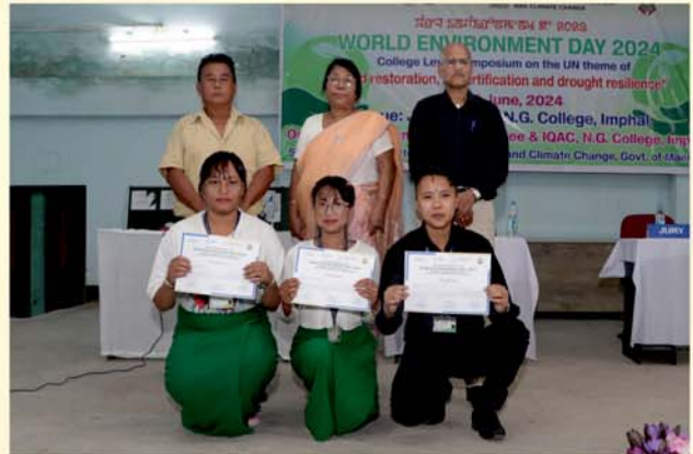
Symposium Prize Winners on World Environment Day 2024