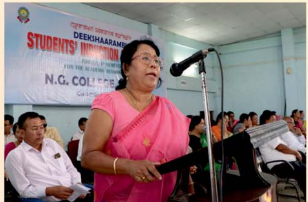
Students' Induction Programme 2023-24