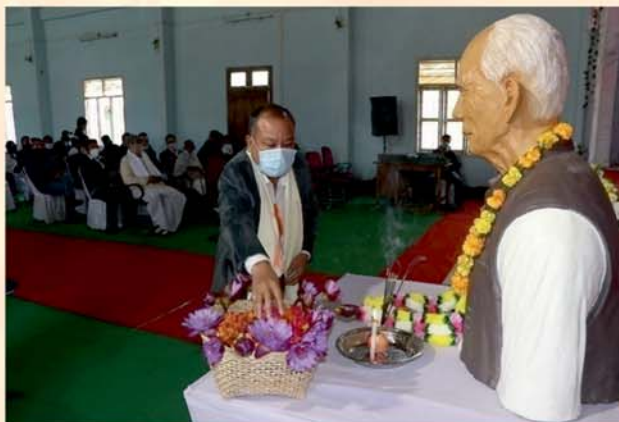
Floral tribute to the founder