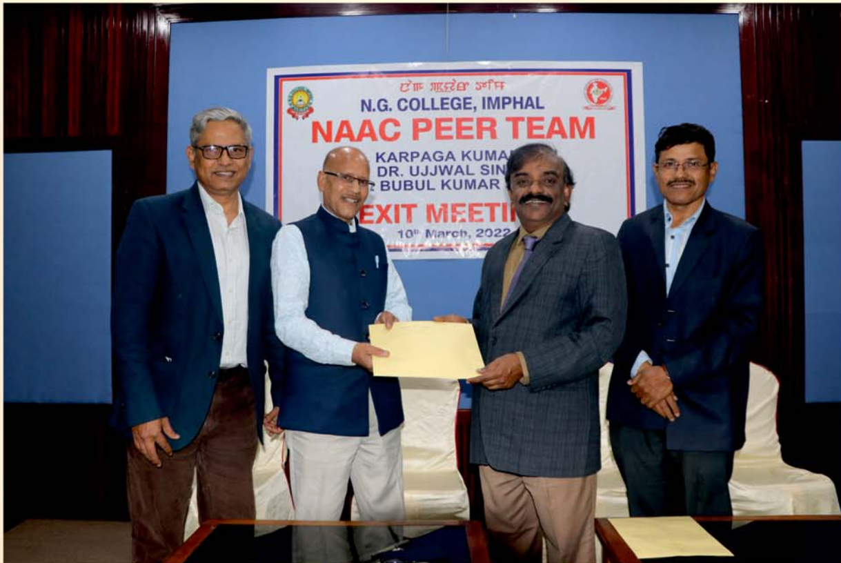
A NAAC ACCREDITED COLLEGE WITH CGPA 2.43