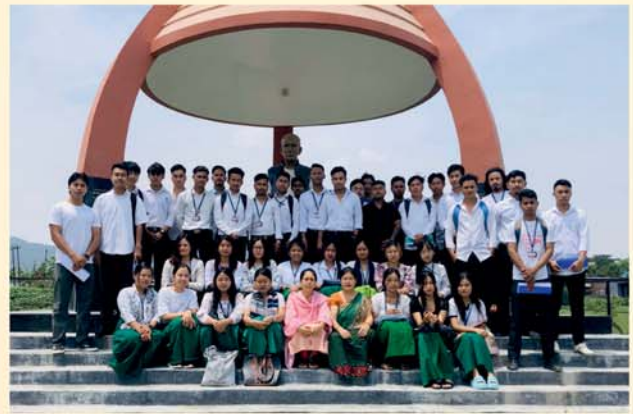
6th Semester Students 2023-24 of Edn. Dept.