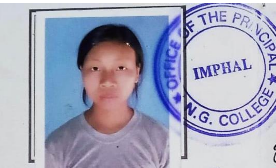
Thajamanbi Certificate and photo